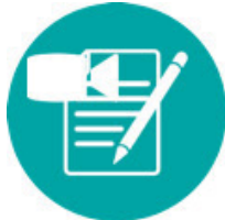
SEO Content Blog & Video