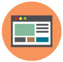
On-Page Tech SEO