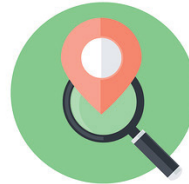
SEO Business Listings