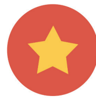
Ratings & Reviews